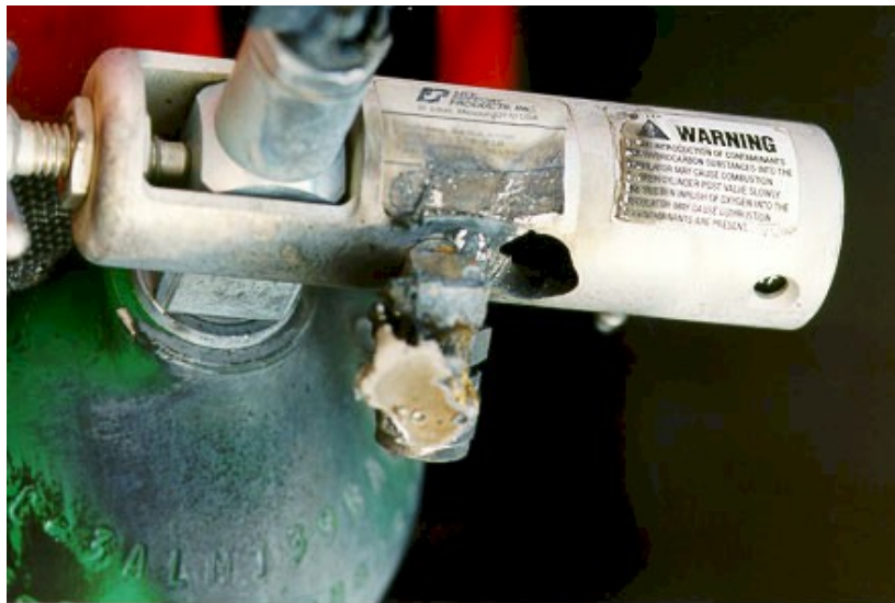
Photo 6: This photo depicts the warning label that is placed on the retrofitted regulator. The sticker serves as a warning as well as an identifier that the regulator has been retrofitted.